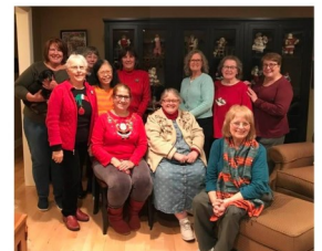
Our cookie bakers for the Living Nativity—Dec. 2019